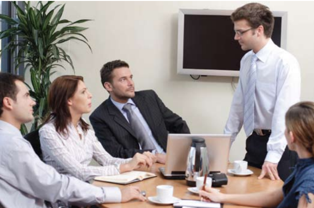
The business must be involved early in the Big Rules decisions

A note on resource planning: Physical resources: planning a staging area to do the cleanup is no different than any other system. It will require disk space, processing power and people to do the job. The business people already have jobs and you will hear this more than once if you ask them to start cleaning and standardizing data. The only mitigating factor here is to plan early. Data cleanup does not come naturally and the ramp-up is typically long.